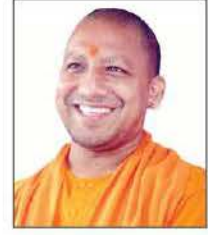
Yogi Adityanath Chief Minister Uttar Pradesh

No.-823/78-2-2021-254 L.C/2019TC Lok Bhawan, Lucknow-226001 Date : 09 April 2021