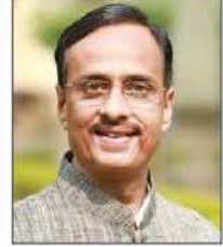
Dr. Dinesh Sharma Deputy Chief Minister Uttar Pradesh