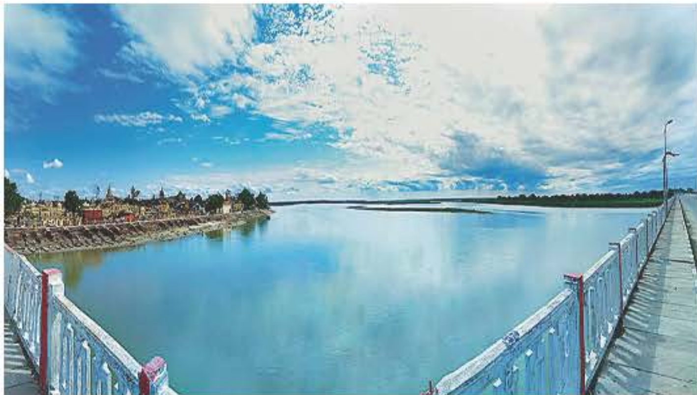
A view of the Naya Ghat and Sarayu River

Ayodhya has stood the test of time and multiple invasions and is fast becoming a centre of cultural diversity, community assimilation and a vital destination for tourism.