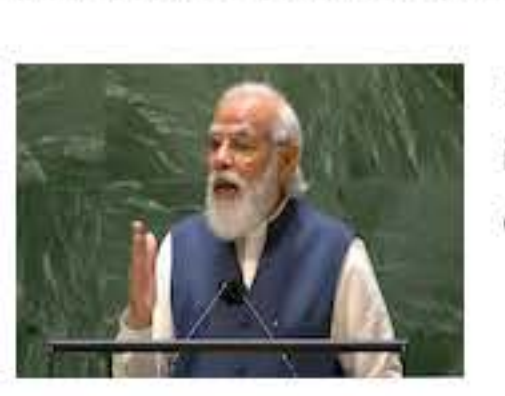
PM Narendra Modi inaugurates mayors' conference in Varanasi