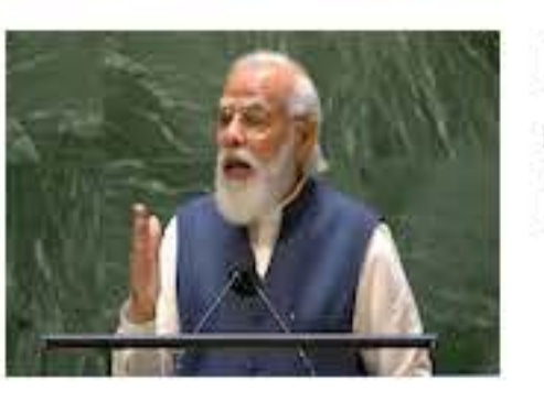
PM Narendra Modi to meet around 40 BJP MPs from UP today

The industry representatives, on the other hand, expressed commitment towards contributing to the Aatmanirbhar Bharat vision of the prime minister and praised several steps taken by the government like PM GatiShakti and IBC.