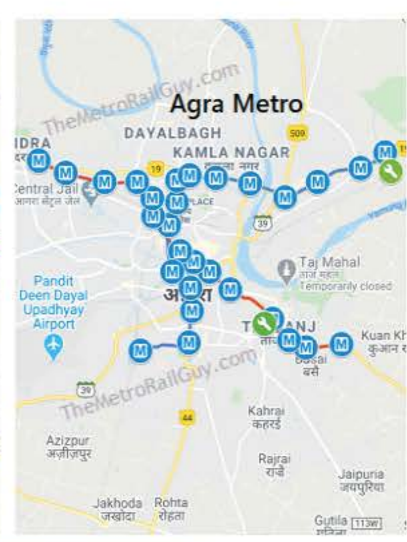
View Kanpur Metro route map & info and Agra Metro route map & info

be a while before civil work starts on Agra & Kanpur metros' second lines.