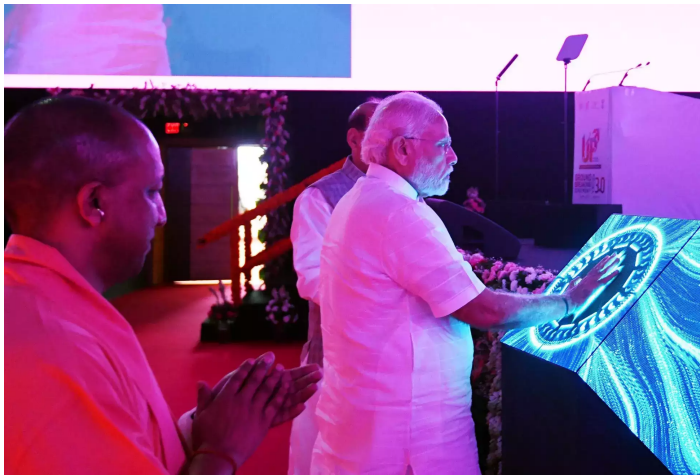
PM Modi inaugurates the Ground Breaking Ceremony 3.0 of the UP Investors Summit in Lucknow on Friday. CM Yogi Adityanath is also seen.

Launch ing a total of 1,406 project s worth over Rs 80,000 crore in Luckno w,