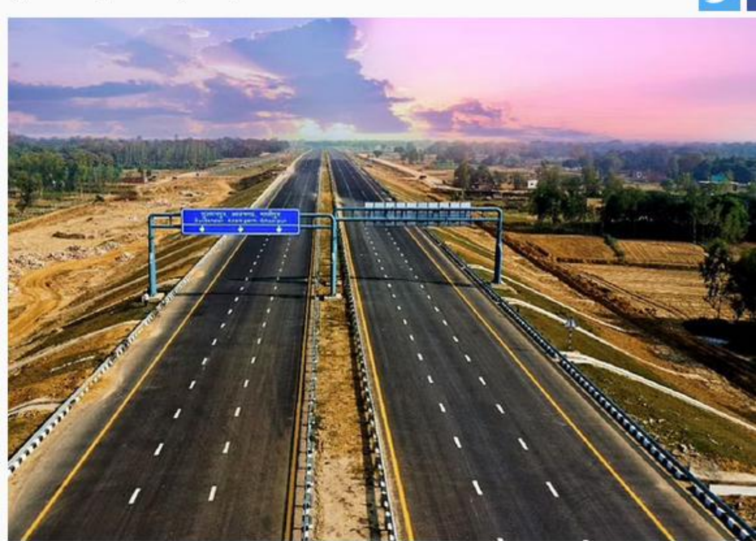
Purvanchal Expressway in UP (UP)