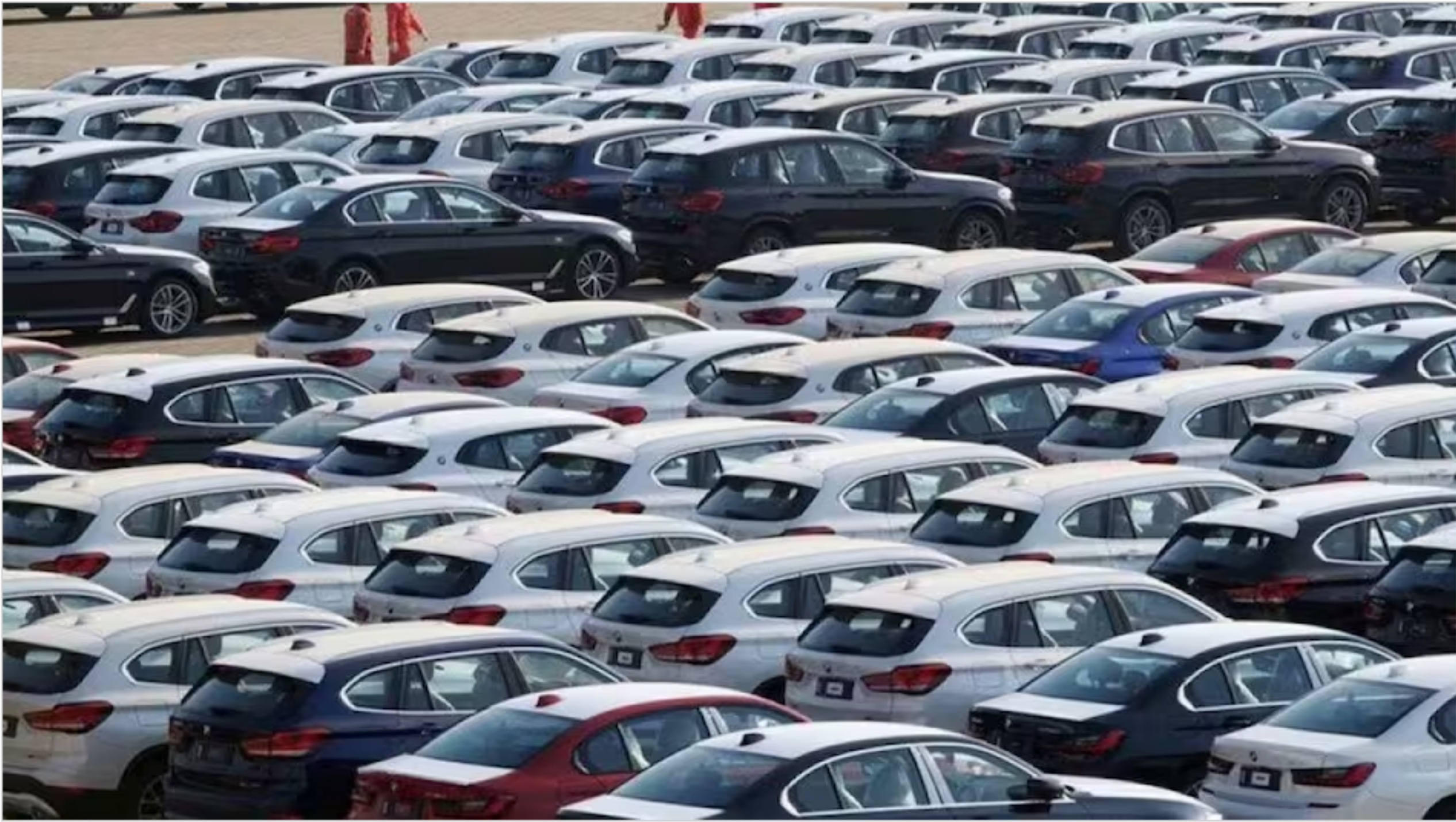
Uttar Pradesh emerges as the frontrunner in automobile sales for Q1 2023, shows SIAM data