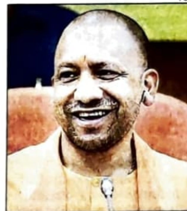
Chief Minister Yogi Adityanath

DA has amended the e-tender date for allotment of land for hotel construction.