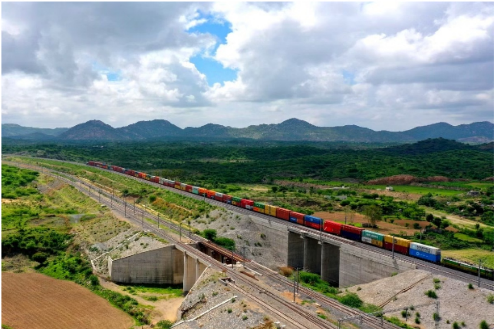
A dedicated freight corridor.

Seventy-eight per cent of the Western Dedicated Freight Corridor (WDFC) has been completed, the Parliament was informed last week.