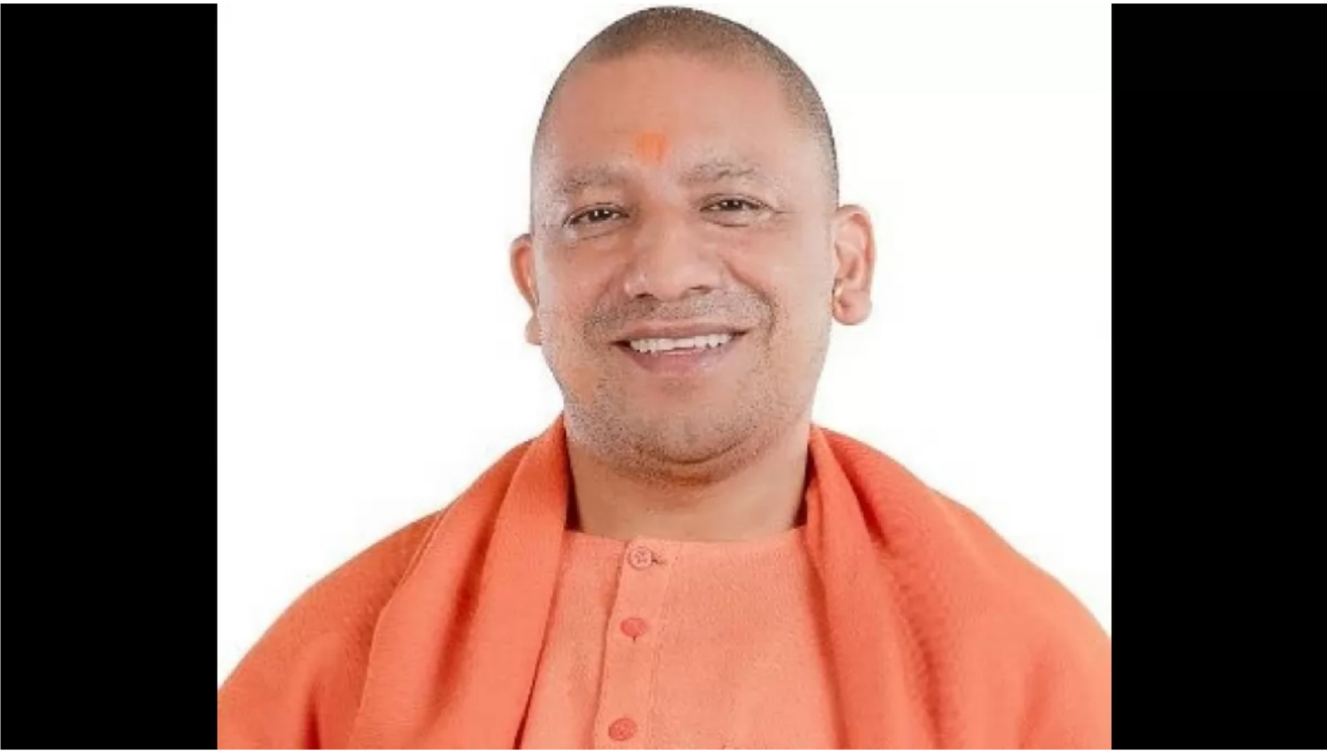
Uttar Pradesh Chief Minister Yogi Adityanath X/CMOfficeUP