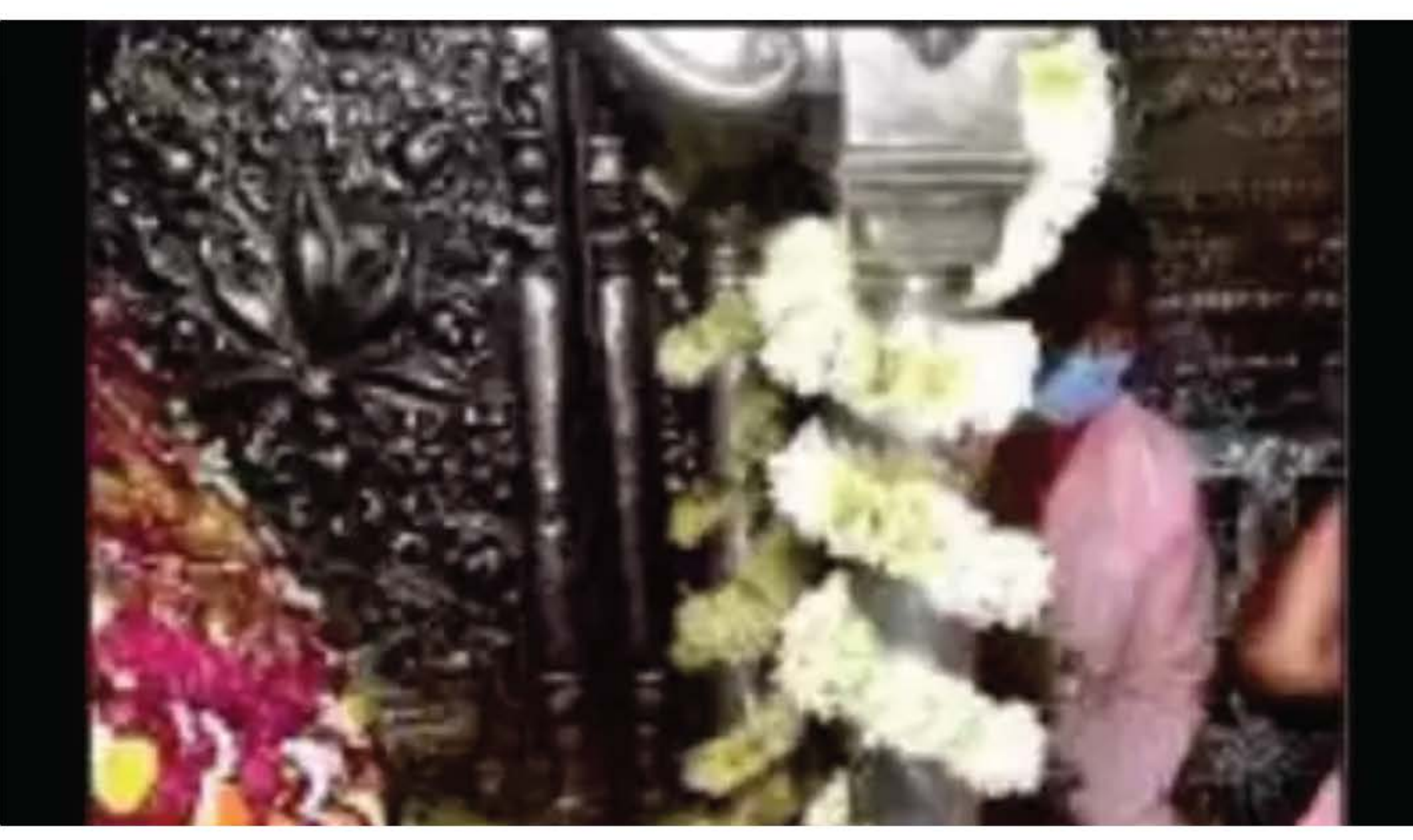
A view of the Vindhyavasini Devi Temple in Mirzapur(File Photo)

LUCKNOW: In a big push to religious tourism, the <u>UP Cabinet</u> cleared a proposal to set up development boards for Vindhya and Chitrakoot. Chief minister <u>Yogi Adityanath</u> will head the twin boards, which will oversee development projects, including infrastructure, religious and cultural promotion.