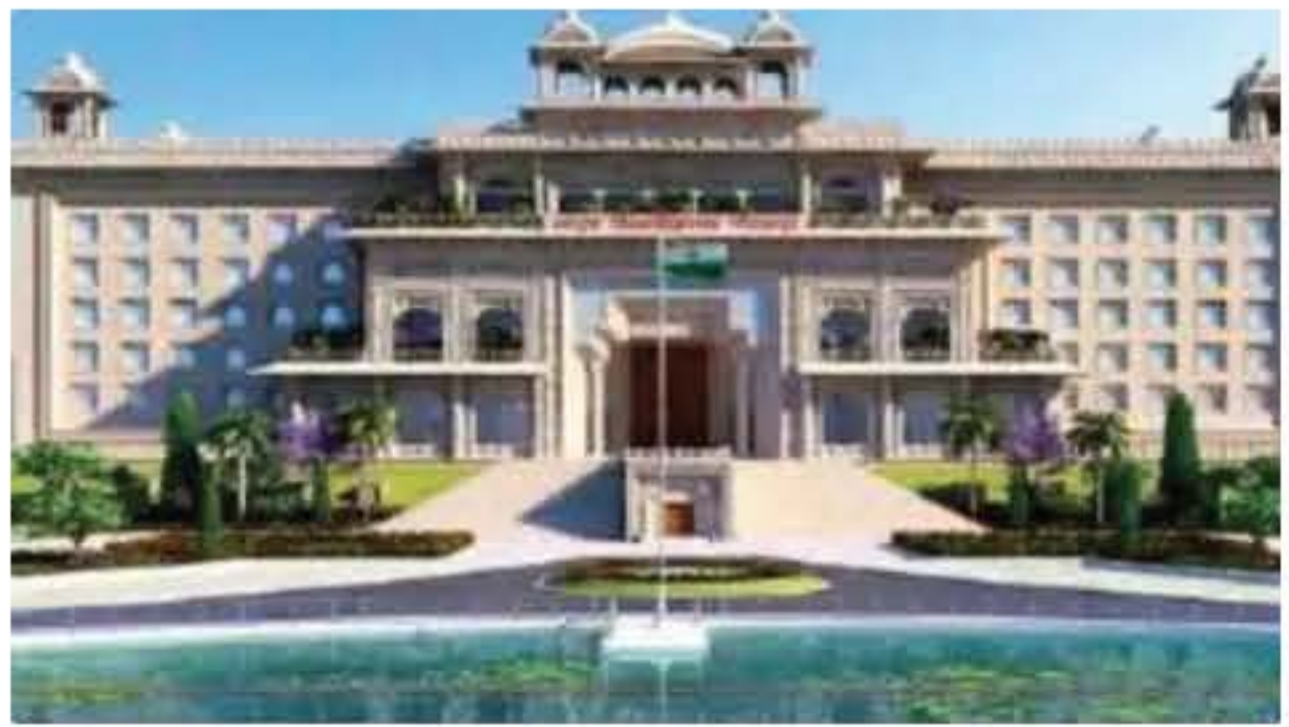
An artist's impression of Ayush University

LUCKNOW: Gorakhpur, the city known for its handloom and terracotta crafts, is on a transformation trip.