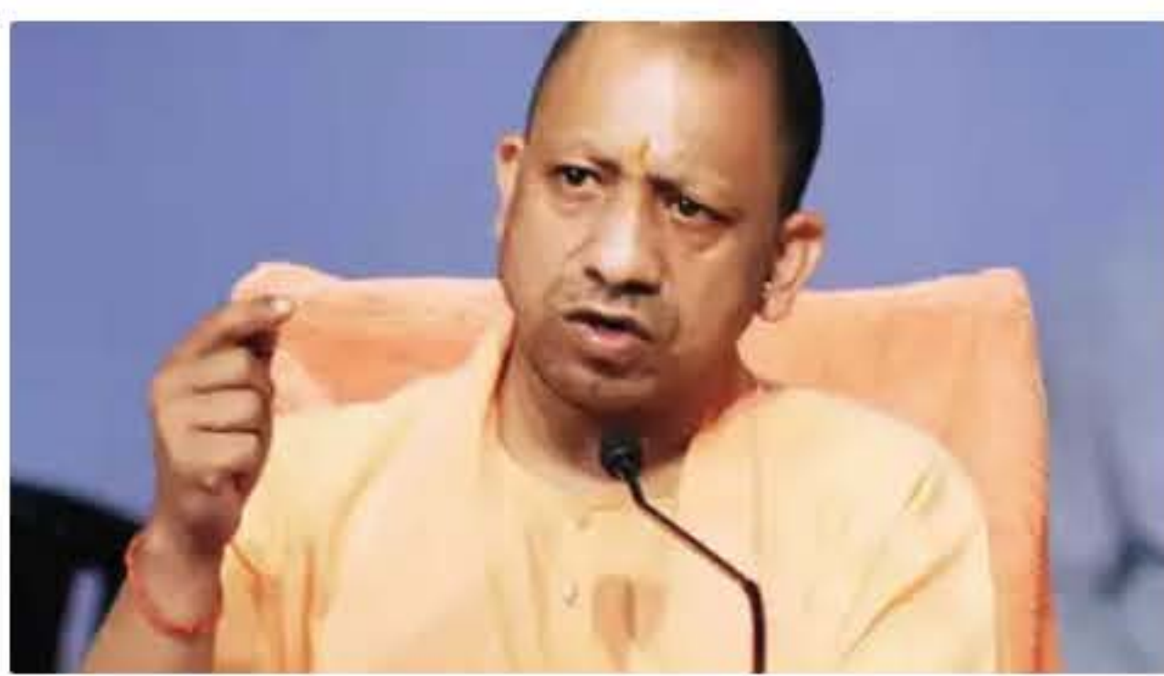
During the cabinet meet, chief minister Yogi Adityanath said, areas where industrial clusters will be created should be immediately earmarked (File Photo)

LUCKNOW: With 93% land for Ganga Expressway already acquired, the government will begin the bidding process for construction of the 594km greenfield project.