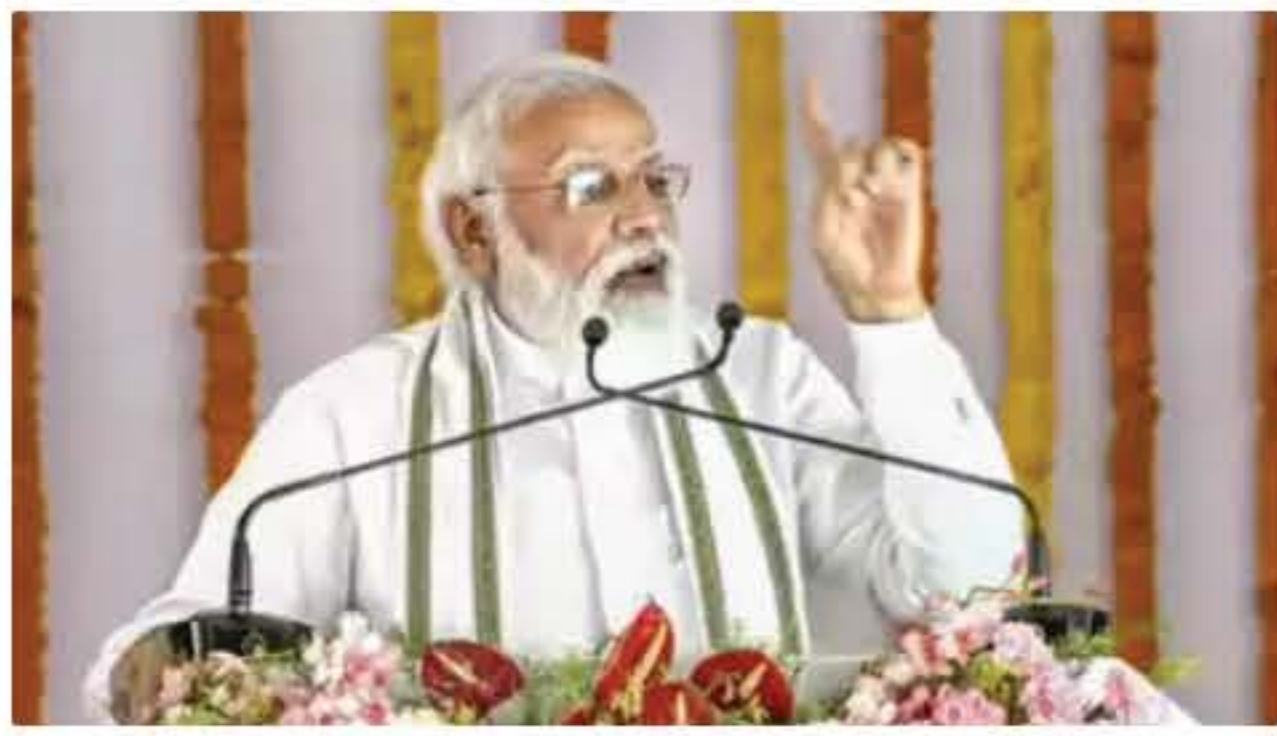
PM Narendra Modi addressing the gathering after laying the foundation stone of the Raja Mahendra Pratap Singh University in Aligarh, UP on Tuesday.

NEW DELHI: Prime Minister Narendra Modi said on Tuesday that Aligarh, which was known to manufacture locks for securing houses, will now play an important role in securing the country's borders.