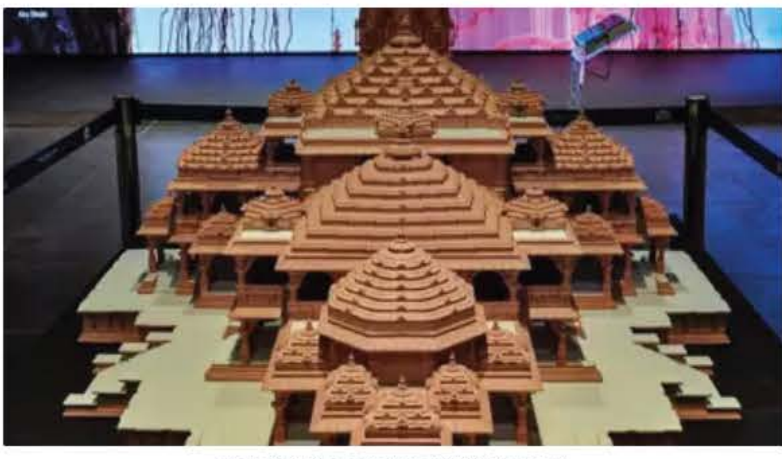
The India Pavilion at the Expo 2020 in Dubai

DUBAI: For Dubai, Expo 2020 is what the Olympics were to Japan, just that the Covid situation is not a concern in the UAE. The event which has been delayed by a year due to the pandemic, is seeing locals complain about the long wait for cabs but is also seen to be a major boost for tourism and a boost for the economy.