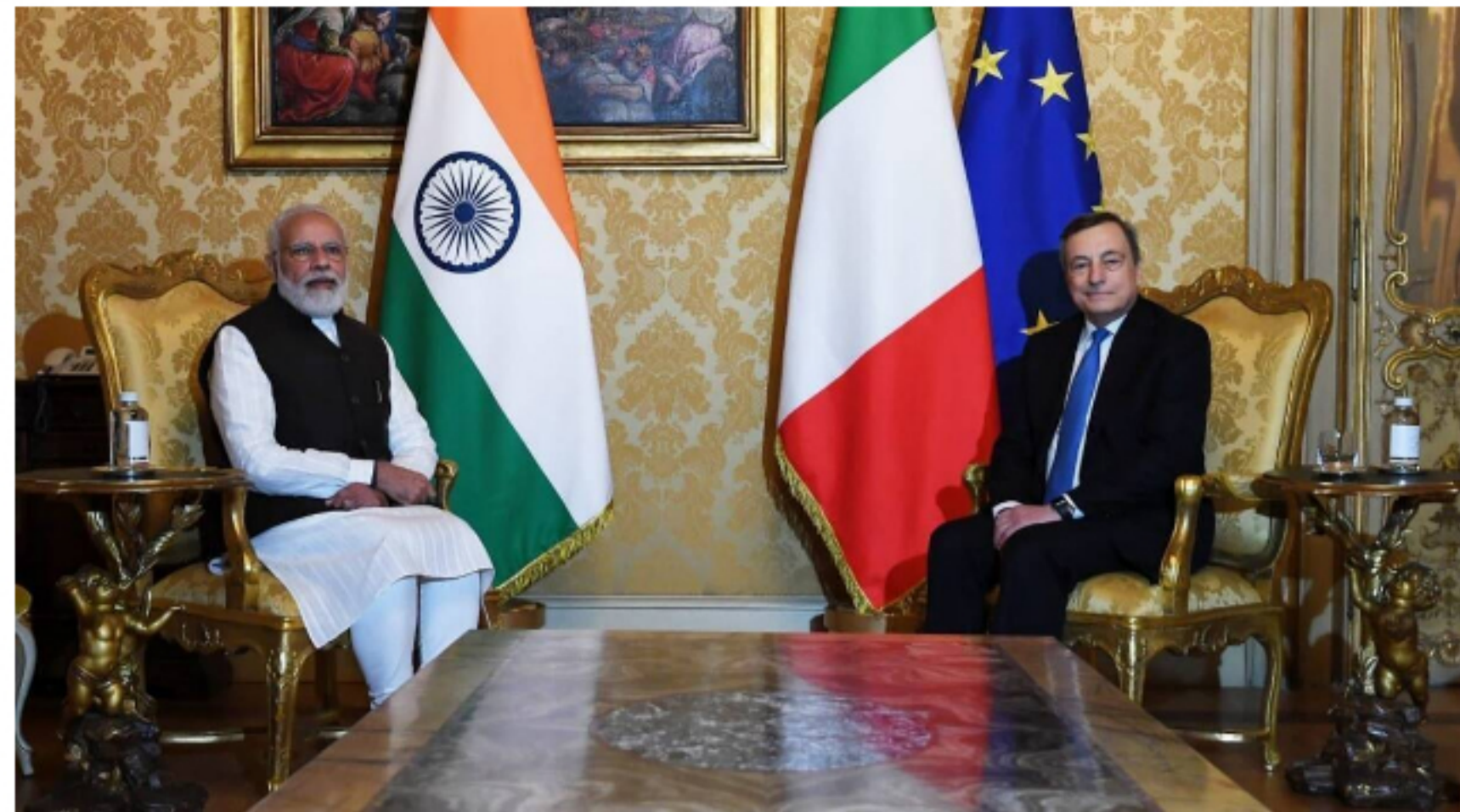
PM Modi with his Italian counterpart Mario Draghi in Rome.

Prime Minister Narendra Modi met Italian Prime Minister Mario Draghi and top leaders of the European Union in Rome on Friday, ahead of the G20 Summit on Saturday.