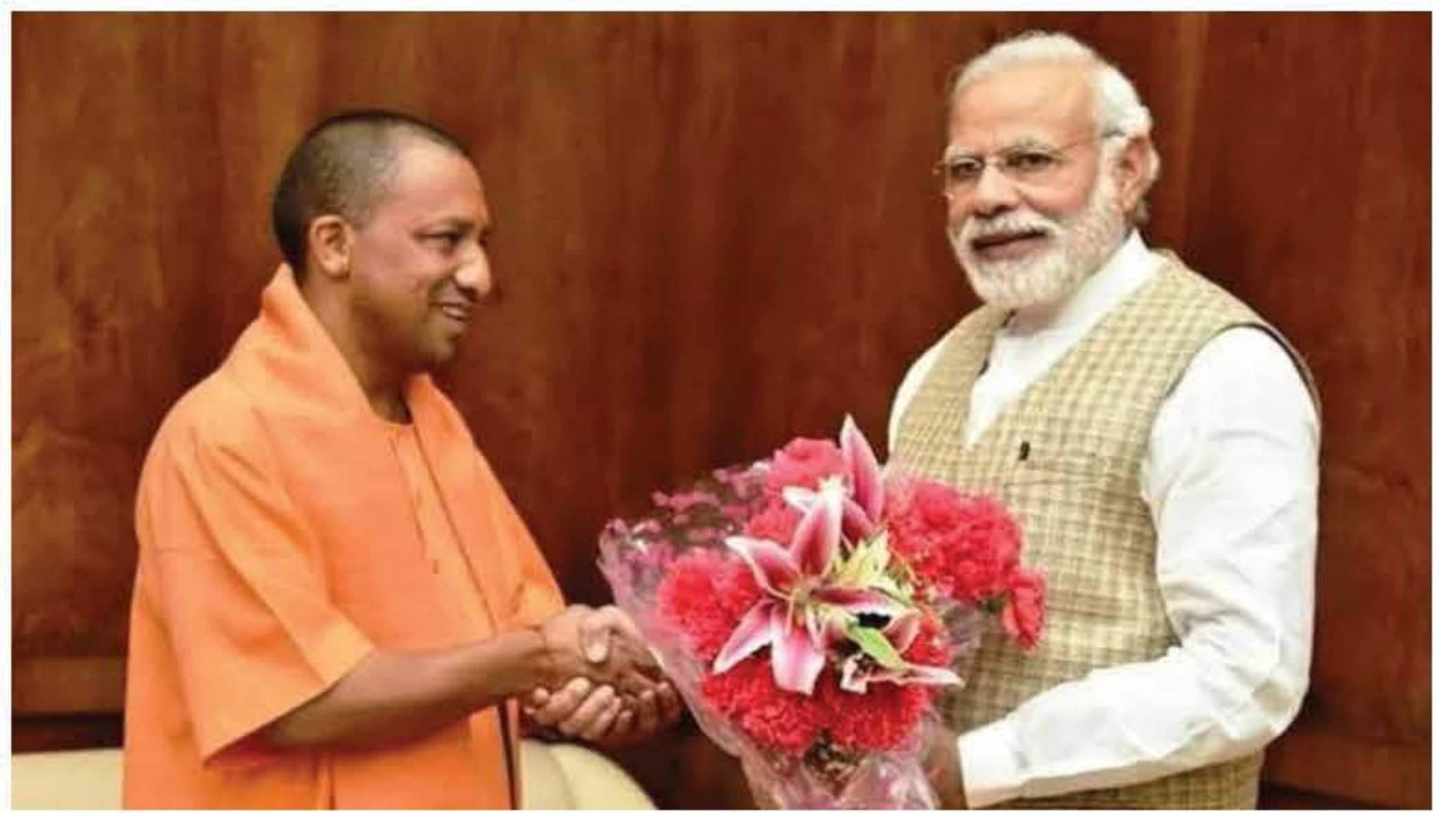
Prime Minister Narendra Modi is all set to attend the ground-breaking ceremony of Yogi government in Lucknow. (File photo)

Prime Minister Narendra Modi, union ministers and business tycoons will attend the third ground-breaking ceremony of the Yogi government in Lucknow on June 3.