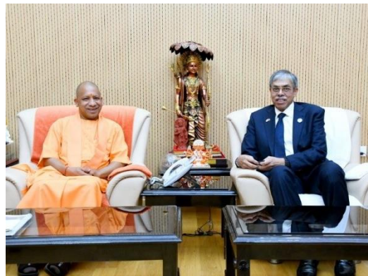
Hon'ble Chief Minister meets Bangladesh's High Commissioner H.E. Mr. Muhammad Imran