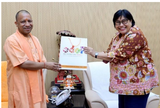
Hon'ble Chief Minister greets the Indonesia Ambassador H.E. Ms. Ina H Krishnamurthy

The State witnessed the visit of eminent foreign dignitaries like the Canadian High Commissioner, H.E. Mr. Cameron Mackay, Indonesian Ambassador, H.E. Ms. Ina Hagniningtyas Krisnamurthi, Bangladesh High Commissioner, H.E. Mr. Muhammad Imran, a delegation led by Hon'ble Finance Minister of Singapore, Mr. Vivian Balakrishnan, a delegation from Israel, led by Ambassador of Israel, H.E. Mr. Naor Gilon, delegation from Indo-Canadian Chamber of Commerce among others. They expressed confidence in the leadership of Hon'ble Chief Minister and expressed keen interest in working together on the path of economic prosperity.