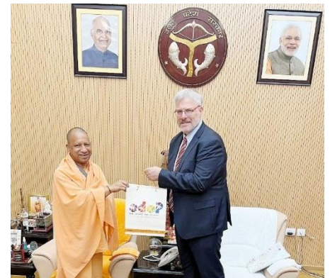
Hon'ble Chief Minister greets the Israel Ambassador H.E. Mr. Naor Gilon

The State witnessed the visit of eminent foreign dignitaries like the Canadian High Commissioner, H.E. Mr. Cameron Mackay, Indonesian Ambassador, H.E. Ms. Ina Hagniningtyas Krisnamurthi, Bangladesh High Commissioner, H.E. Mr. Muhammad Imran, a delegation led by Hon'ble Finance Minister of Singapore, Mr. Vivian Balakrishnan, a delegation from Israel, led by Ambassador of Israel, H.E. Mr. Naor Gilon, delegation from Indo-Canadian Chamber of Commerce among others. They expressed confidence in the leadership of Hon'ble Chief Minister and expressed keen interest in working together on the path of economic prosperity.