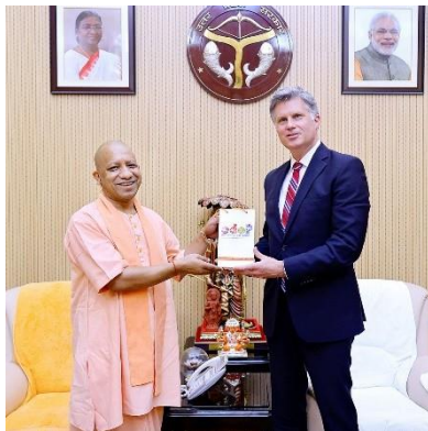
Hon'ble Chief Minister greets Canadian High Commissioner H.E. Mr. Cameron Mackay

The Uttar Pradesh government is leaving no stones unturned to establish a robust Embassy connect for attracting foreign investments in the State and towards this end, the State Government has actively organised various meetings and interactions with respectable dignitaries and delegates from various countries and taken these interactions as an opportunity to highlight the immense growth potential and investment opportunities that the State has to offer.