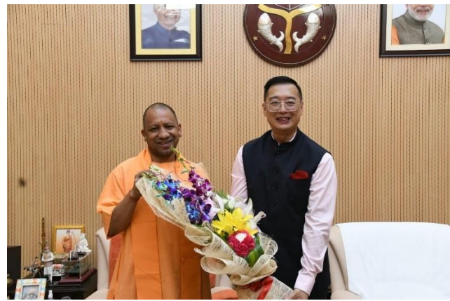
Hon'ble Chief Minister greets the Singapore High Commissioner H.E. Mr. Simon Wong