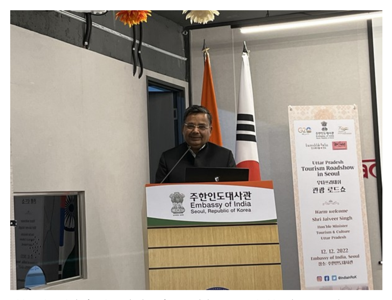
Minister Jaiveer Singh of Tourism and Culture of Uttar Pradesh Government is giving a keynote speech.