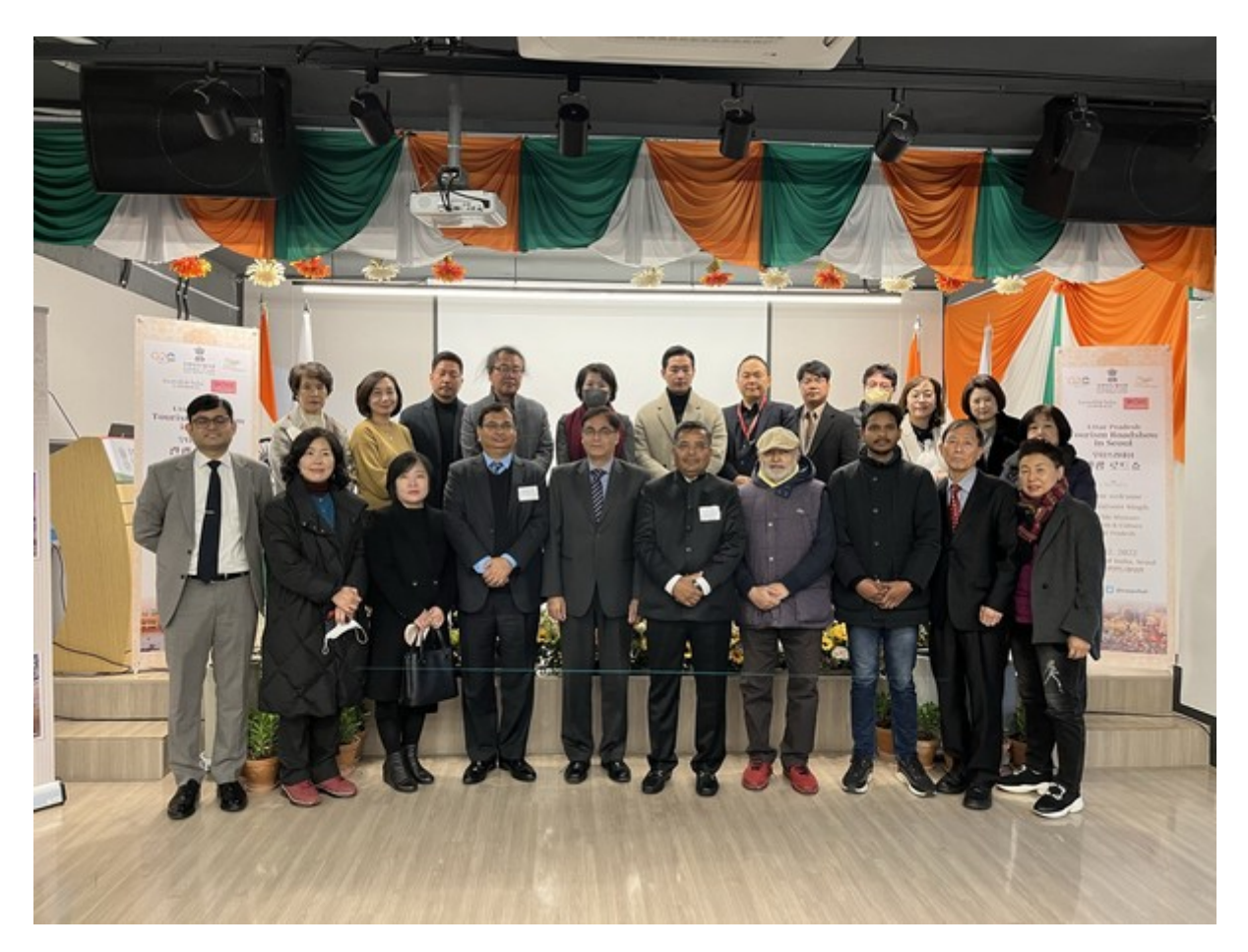
After the road show, the attendees took a group photo.

Finally, there was a photo shoot for all attendees, and the road show ended with a Q&A session while eating tea and refreshments unique to India.