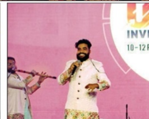
BIGGER AND BETTER: Cultural evening along with installations and full-packed venue kept the crowd growing on day two of Global Investors Summit on Saturday