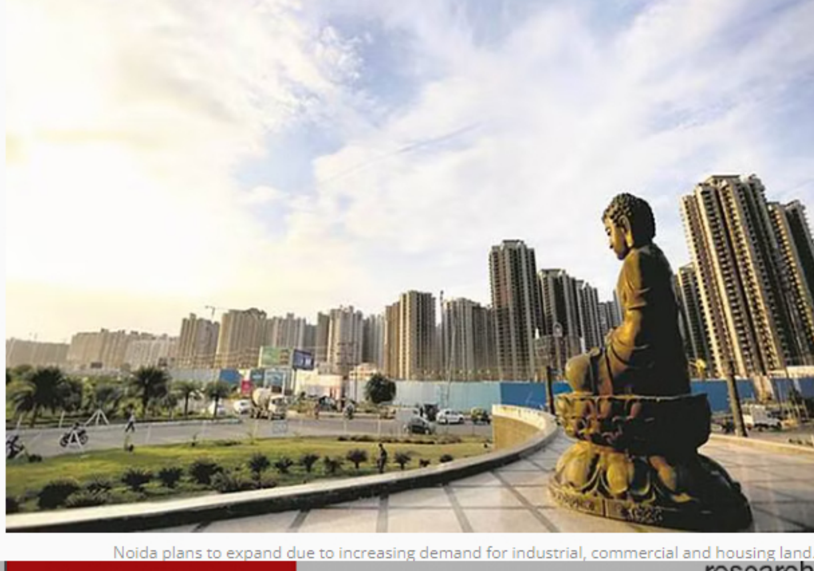
Noida plans to expand due to increasing demand for industrial, commercial and housing land.