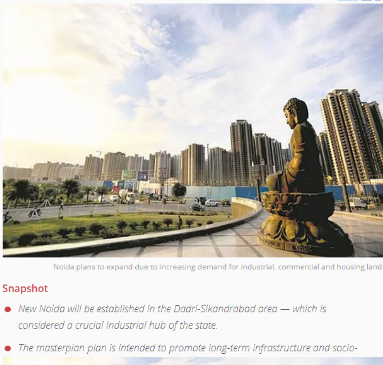
Noida plans to expand due to increasing demand for industrial, commercial and housing land.