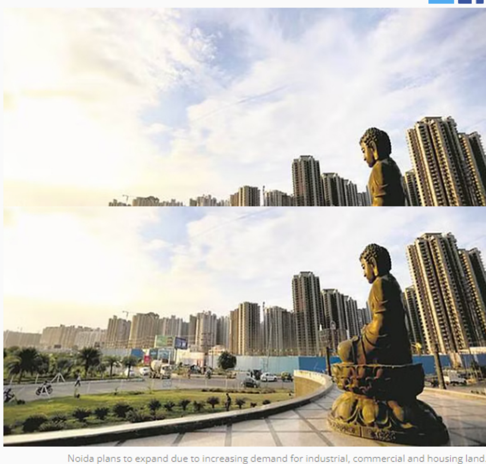
Noida plans to expand due to increasing demand for industrial, commercial and housing land.