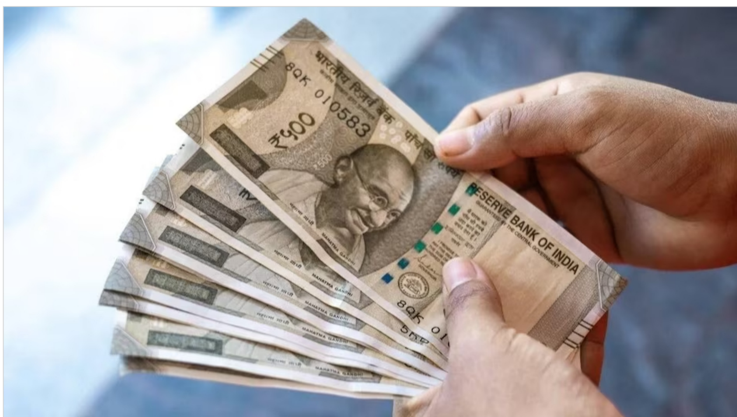
Uttar Pradesh has topped the list by spending Rs 5.31 lakh crore on infrastructure development