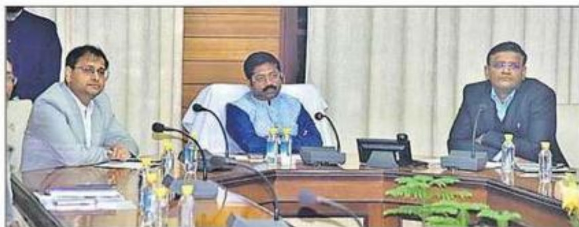
U.P. industrial development minister Nand Gopal Gupta 'Nandi' reviewing preparations for state's participation in WEF

'Nandi' said WEF will prove to be a suitable place for UP to