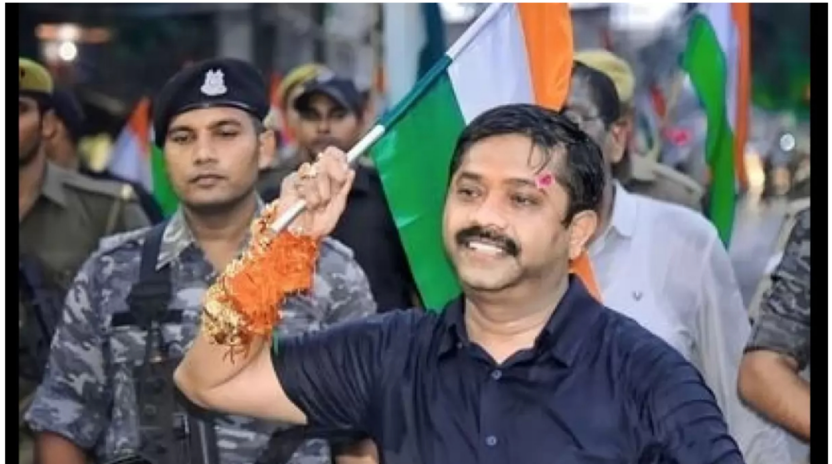
Uttar Pradesh Industrial Development Minister Nandgopal Gupta Nandi.