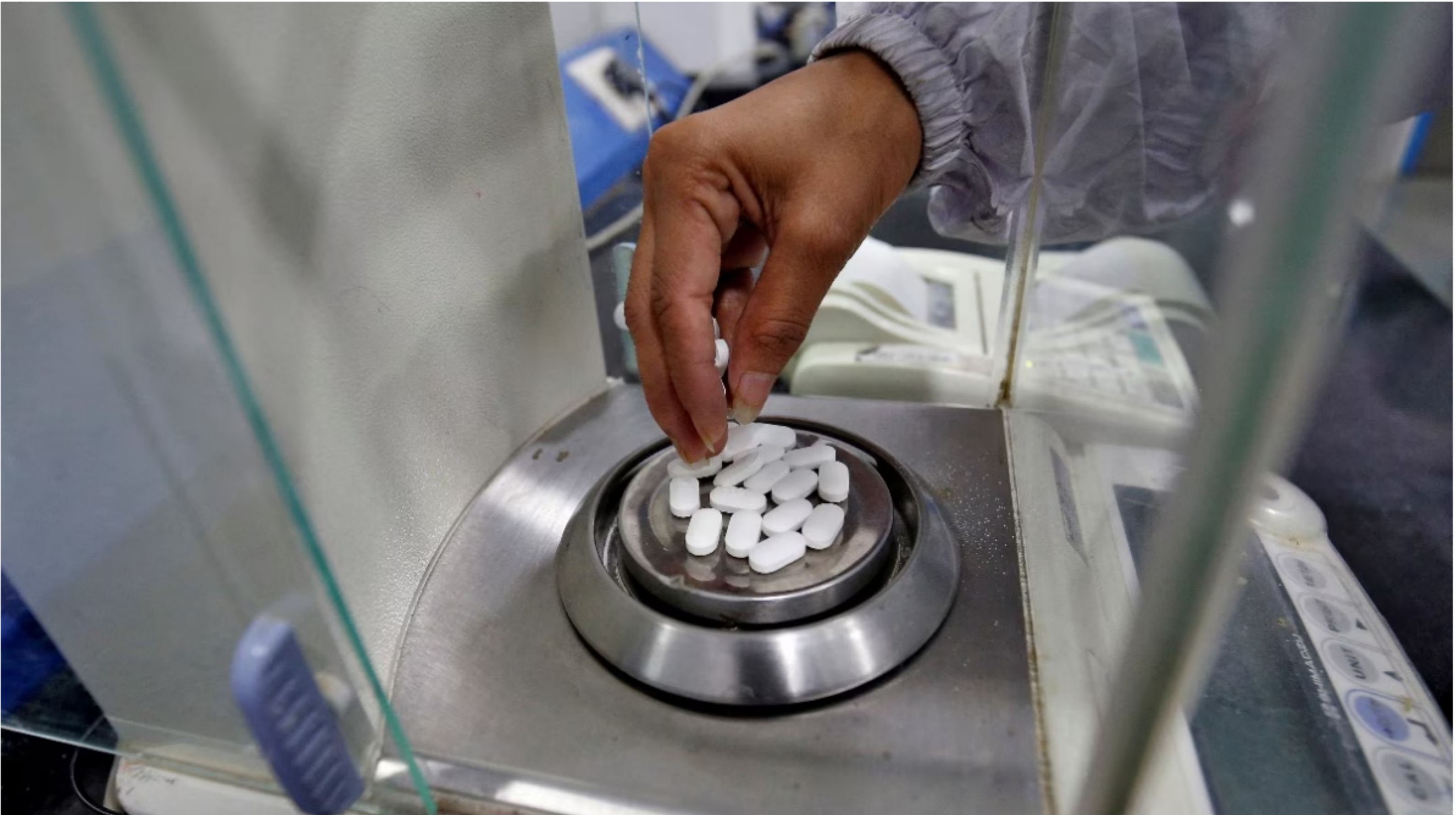
A pharmacist checks weight of medicine