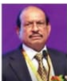
-MA Yusuff Ali, Chairman & MD, LuLu Group

UP offers great opportunities in several sectors under the leadership of CM Yogi Adityanath. We decided to establish the biggest shopping mall in North India in Lucknow. We waited for the new government to learn about their policy. Once the group made a presentation before the Chief Minister's office, the project was expedited. Yogi government is committed to crossing new milestones. The Middle East government is seriously considering investing in Uttar Pradesh.”