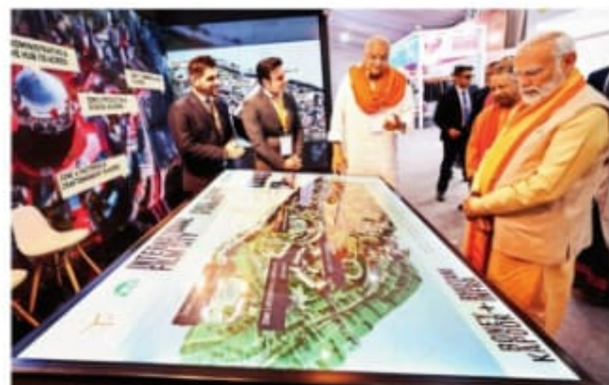
CONSUMER CONNECT INITIATIVE