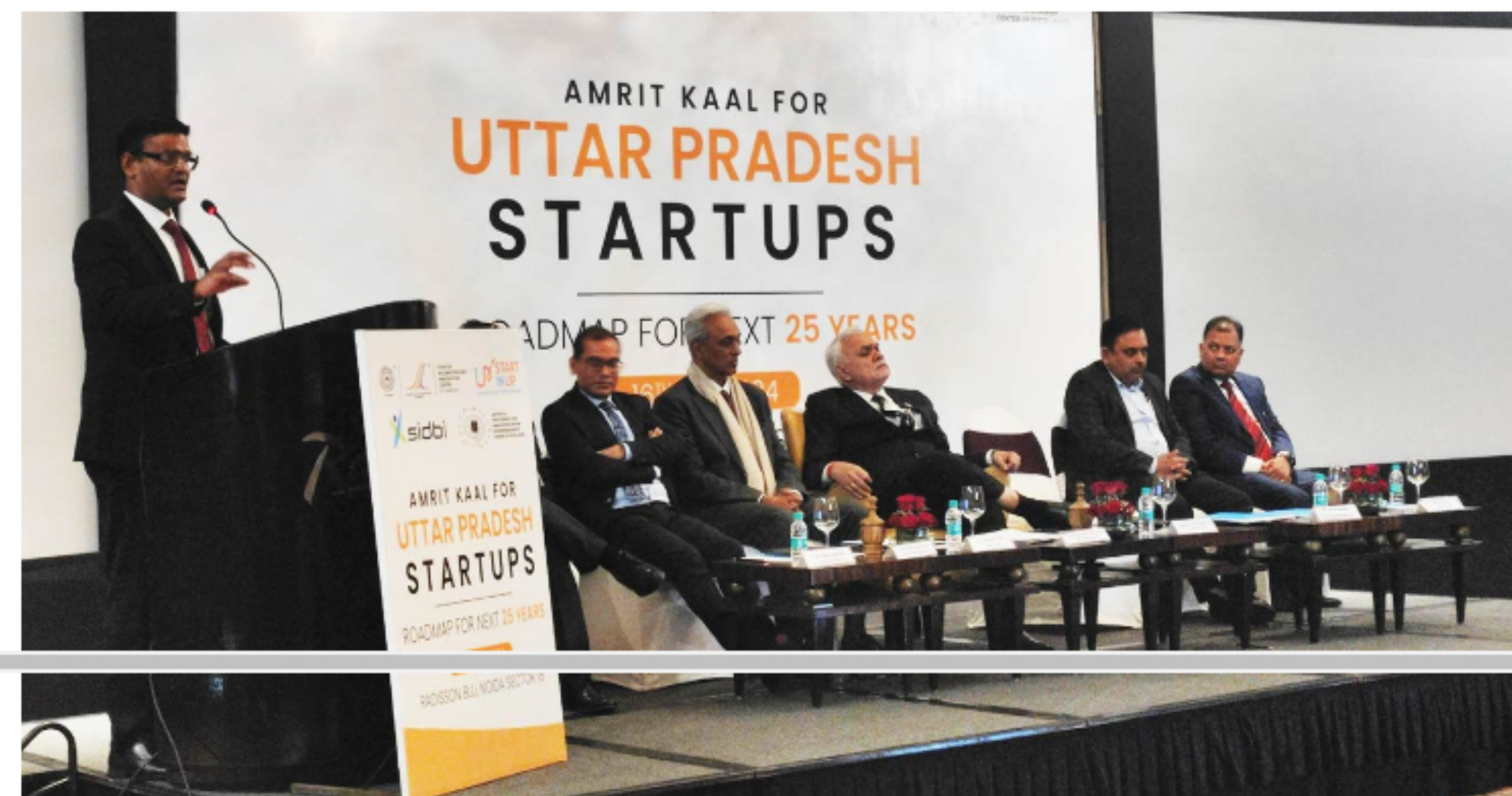
Uttar Pradesh Unveils Ambitious Plan to Become India's Premier Startup Hub