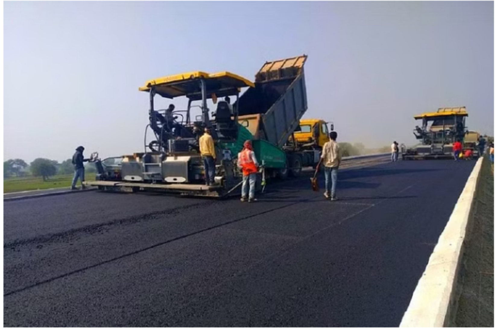
Ganga expressway construction in Uttar Pradesh.

The Ganga expressway — which will connect Meerut with Prayagraj — will be open to the general public by December 2024 so that devotees can benefit during the Prayagraj Kumbh in 2025.