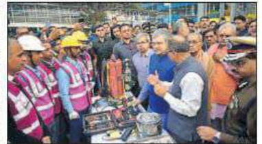
Union railway minister Ashwini Vaishnaw during inspection in Prayagraj on Sunday.

Mobile ticketing arrangements have been made, with railway workers issuing tickets directly to pilgrims. Additionally, pilgrims can book tickets