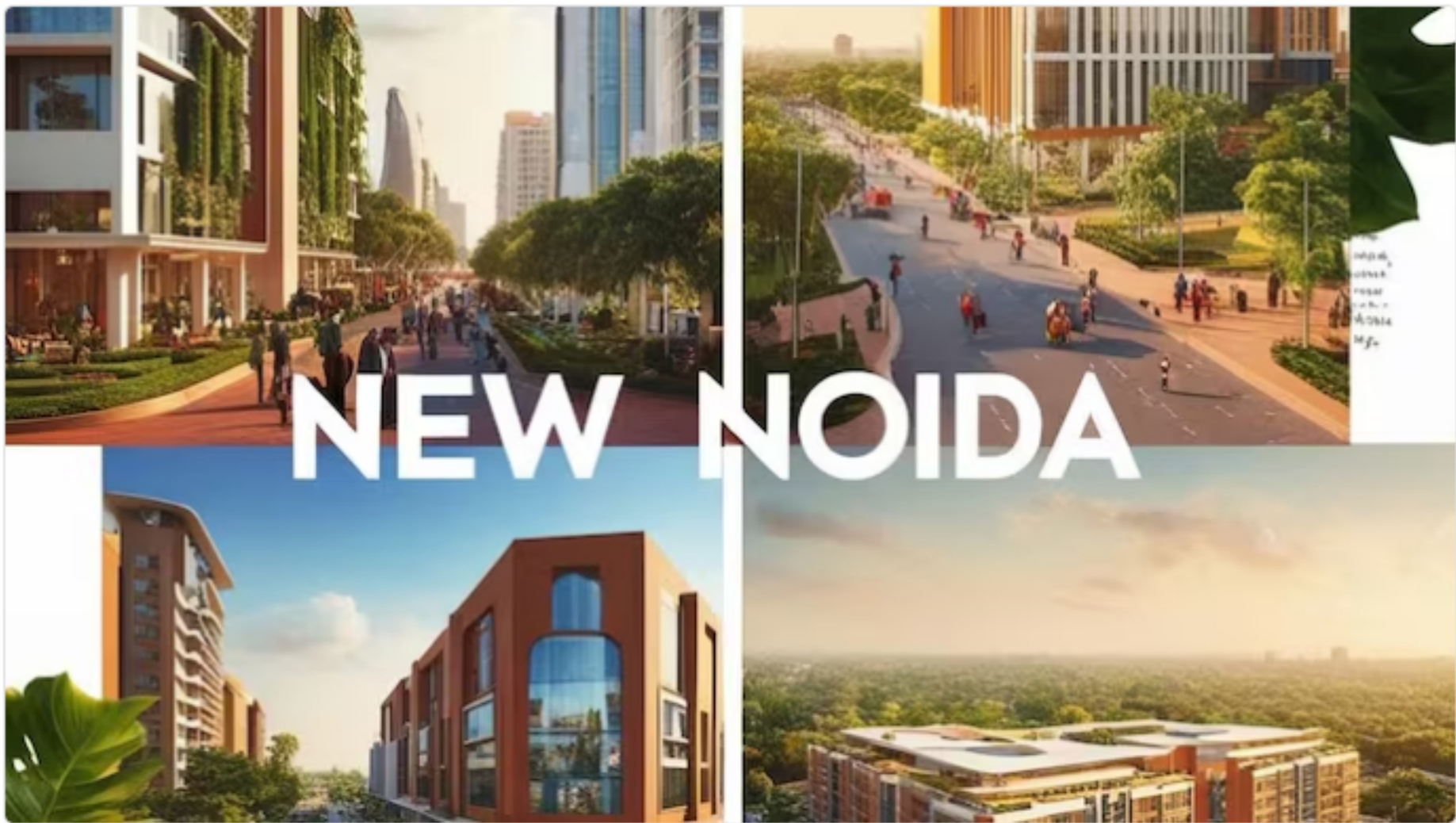
Uttar Pradesh greenlights ambitious 'New Noida Project'. 4-phase development by 2041 (AI Image)