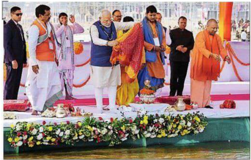
Prime Minister Narendra Modi and Chief Minister Yogi Adityanath perform rituals at Sangam in Prayagraj on Friday

The PM inaugurated the corridors of Akshayvat, Saraswati Koop, Bade Hanuman Temple, Bharadwaj Rishi Ashram and Shringaverpur. Upgradation and development of nine railway stations (Rs 1,610 crore), widening, strengthening, and beautification of 61 roads (Rs 1376 crore), 10 ROB flyovers (Rs 1170 crore), and blocking, change of direction, and strengthening of four drains (Rs 100 crore) were among other projects inaugurated