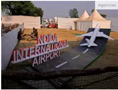
Noida airport plots

The Yamuna Expressway Authority received over one lakh applications for 451 residential plots near the upcoming Noida International Airport. The scheme generated Rs 4,800 crore in registration revenue. The high demand reflects growing interest in the area. A lucky draw will be held on December 27. Plot sizes range from 120 to 260 square meters.