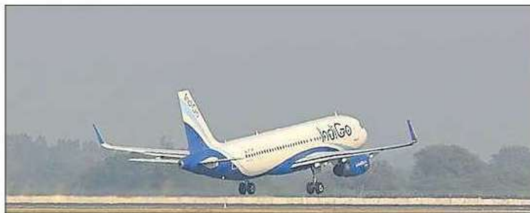
The Noida International Airport conducted a first flight validation test at the newly built airport in Noida (Jewar), on Monday.

In a post on X, Adityanath said, "It's a historic day today for the country and Uttar Pradesh. Under the guidance of Prime Minister Narendra Modi, 'the new India's new Uttar Pra-