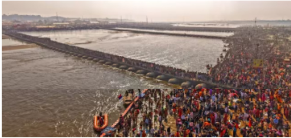
The RWA of Sector 122 will clean the Chhath Ghat and fill it with water brought from the Sangam in Prayagraj.

The Maha Kumbh Mela 2025, currently being held in Prayagraj, Uttar Pradesh, is the world's largest and biggest spiritual congregation. Held after 144 years, this event is deeply rooted in quest for spiritual purification and eternal salvation. Beyond its spiritual importance, the Mahakumbh has evolved India's spiritual tourism industry, transforming Prayagraj into a