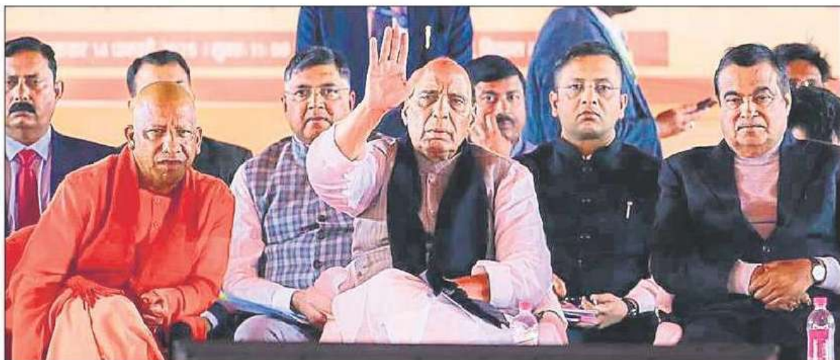
Defence minister and Lucknow MP Rajnath Singh, Union minister Nitin Gadkari and CM Yogi Adityanath during the inauguration ceremony of two flyovers in Lucknow on Friday.

Singh said Uttar Pradesh is witnessing unprecedented development under the leadership of chief minister Yogi Adityanath and efforts are under way to