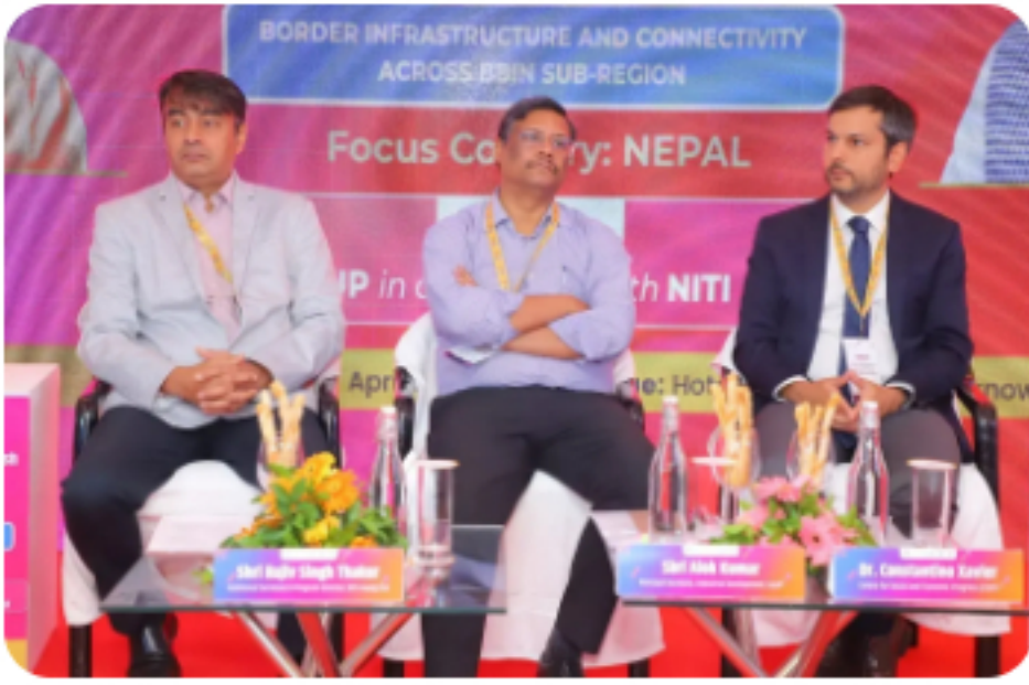
The event brought together officials of NITI Aayog, Centre for Social and Economic Progress (CSEP) along with officials of state government departments, Invest UP and representatives of industrial associations from the Uttar Pradesh-Nepal border districts.

LUCKNOW: A high-level workshop on Border Infrastructure and Connectivity in the BBIN (Bhutan, Bangladesh, India, Nepal) sub-region was held in Lucknow on Tuesday. The objective of the workshop was to deliberate on enhancing cross-border infrastructure , trade, and