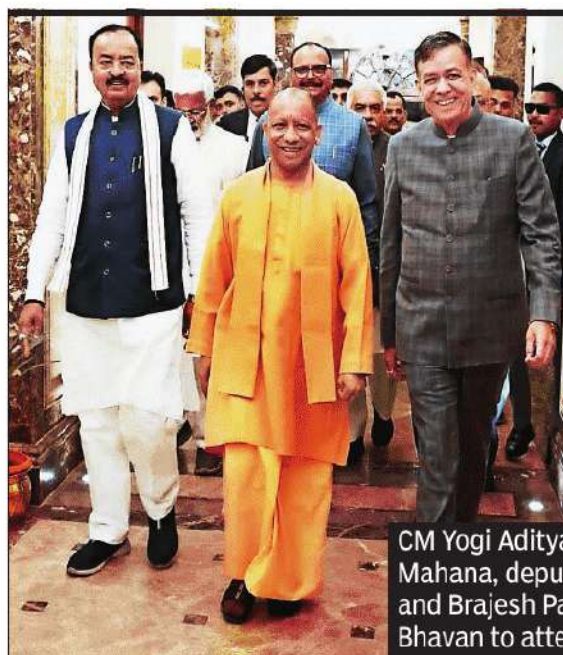
CM Yogi Adityanath, Speaker Satish Mahana, deputy CMs Keshav Maurya and Brajesh Pathak arrive at Vidhan Bhavan to attend the Budget session