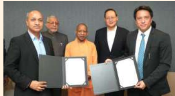
Hon'ble Chief Minister Yogi Adityanath, Uttar Pradesh & Shri Deepak Kumar, Infrastructure & Industrial Development Commissioner with Singapore Cooperation Enterprise