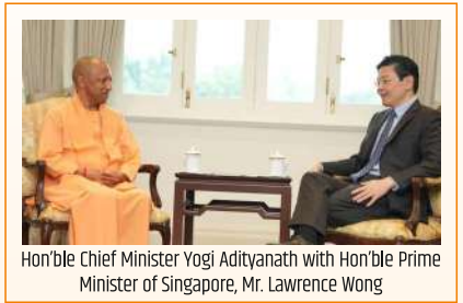
Hon'ble Chief Minister Yogi Adityanath with Hon'ble Prime Minister of Singapore, Mr. Lawrence Wong

On the institutional front, Invest UP signed an MoU with Singapore Cooperation Enterprise for knowledge exchange, governance capacity building, and digital transformation. SATS Ltd also signed an MoU for a cargo complex at Noida International Airport, Jewar, along with a Taj SATS air catering kitchen. MoUs at ITE College Central focused on aviation skilling and capacity building.