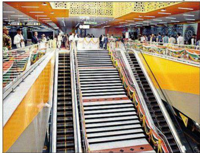
(L) CM Yogi during the inauguration of Agra Metro and the interiors of newly developed Agra Metro station

tion has been completed. This includes three elevated and three underground Metro stations. With the completion of this work, Metro services have also started," the CM said.