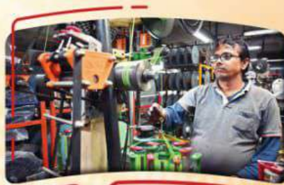
State Warehousing and Logistics Policy 2022 has played an important role in UP's growth